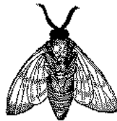
Figure 2: A sample black and white graphic that has been resized.

not simply repeat the figure caption; the figure caption is already readable as text. Moreover, figure captions typically provide context for a figure, whereas the purpose of alt text is to represent the content of the figure in an alternative format.