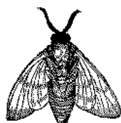
Figure 2: A sample black and white graphic (.eps format) that has been resized with the epsfig command.