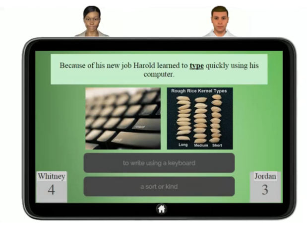
Figure 1: Example trialogue with competition which focuses on the meaning of words from context.

AutoTutor still guides the learner, but the questions can be solved without typed input. The lessons typically start with a 2-3 minutes video that reviews a comprehension strategy. After the review, the computer agents scaffold students through the learning by asking questions, providing short feedback, explaining how the answers are right or wrong, and filling in gaps of information. Figure 1 is an example of the teacher agent (on the left) asking both the learner and the peer agent (on the right) to find the meaning of the word "bank" in the given context. The scores of both the human learner and peer agent are shown under their names. The learner chooses the answer by clicking while the peer agent gives his answer by talking.